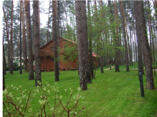
Grand Admiral Resort