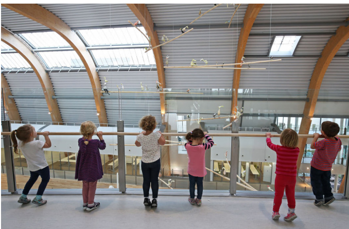
LIVERPOOL'S NEW ALDER HEY CHILDREN'S HOSPITAL, OPENED IN 2015

You can find out more about ESPE Fellowships at www.eurospe.org/awards