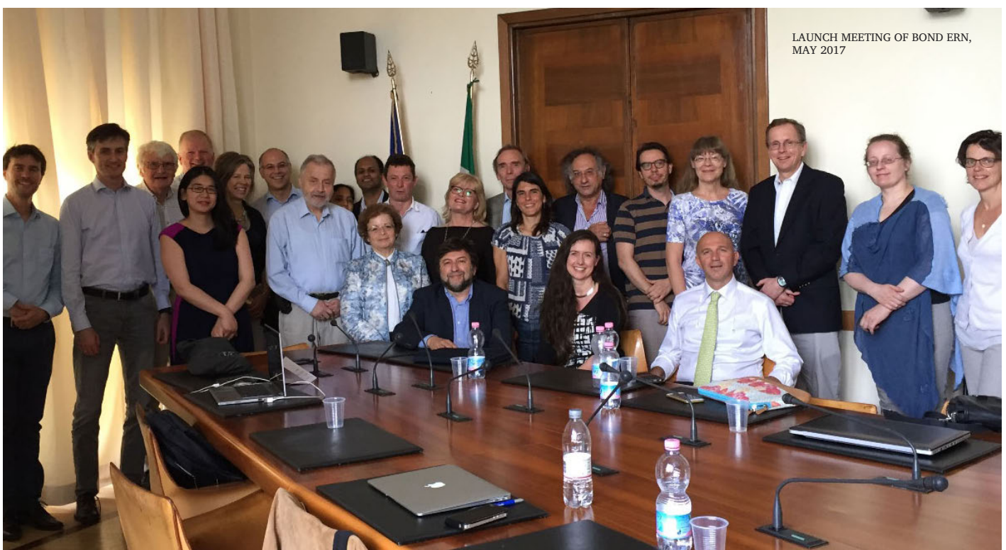
LAUNCH MEETING OF BOND ERN, MAY 2017